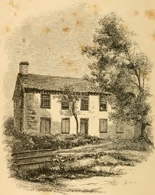
THE OLD PARSONAGE.