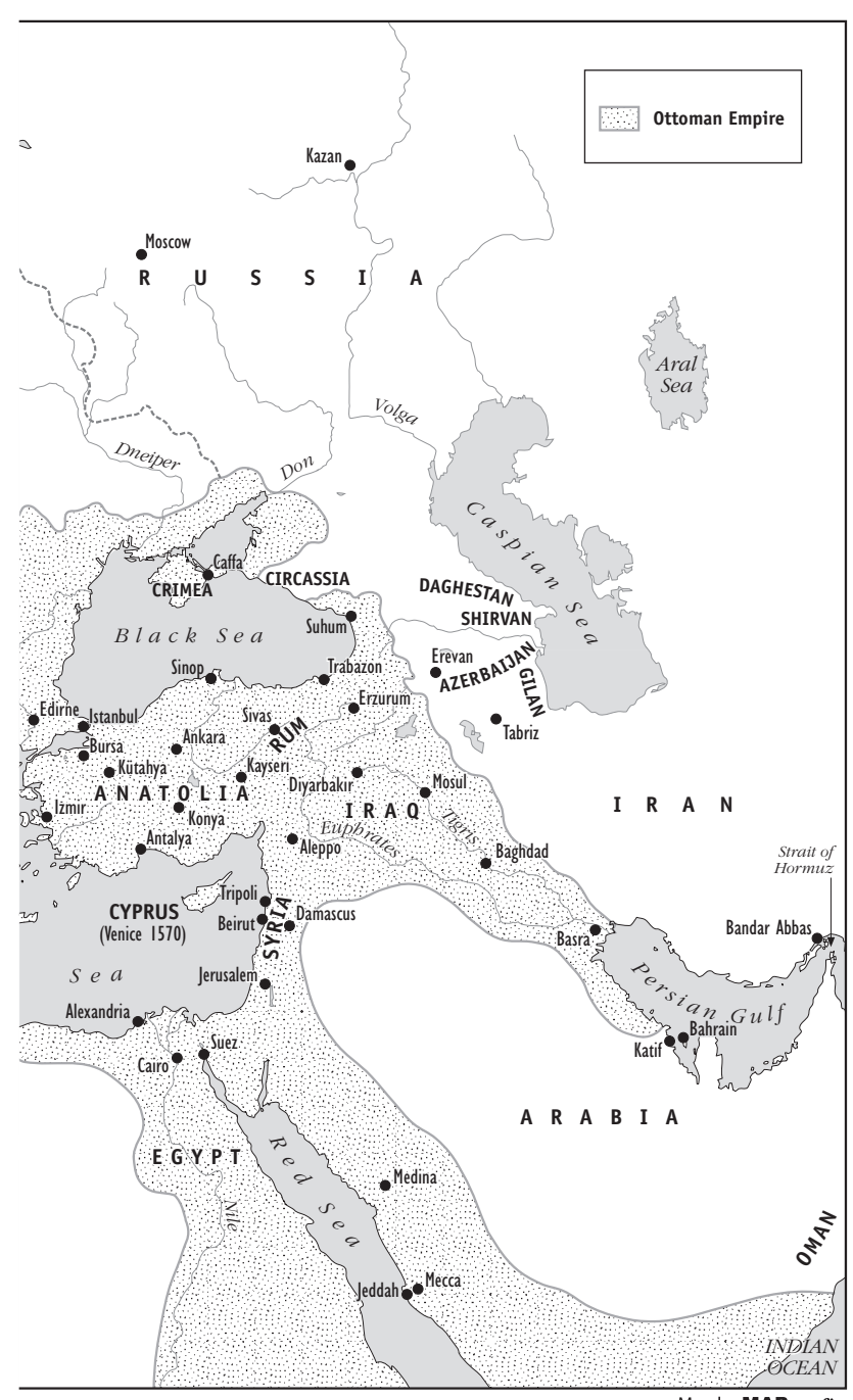
Map by MAP grafix